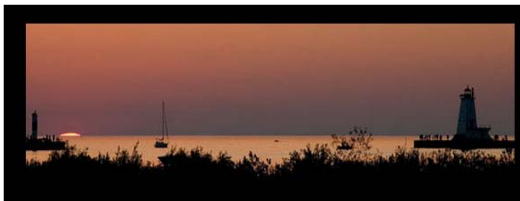
Lake Michigan Sunset