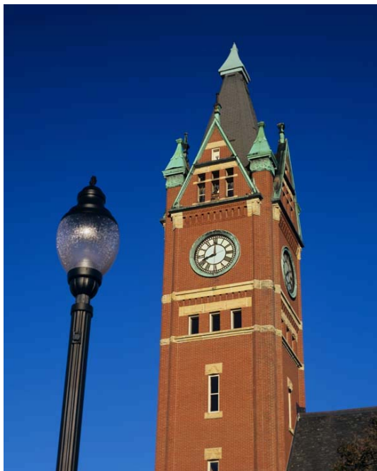
Clock Tower, Delaware County Courthouse, Manchester IA