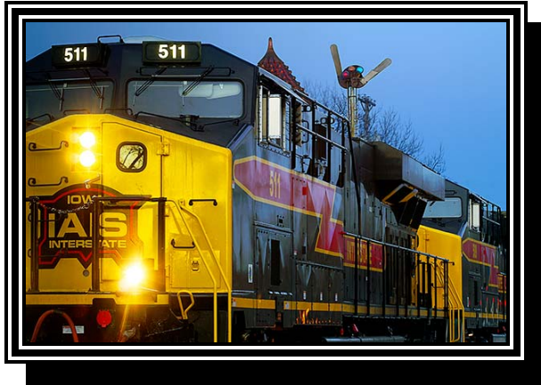
←- 1 st Place – Rick Young