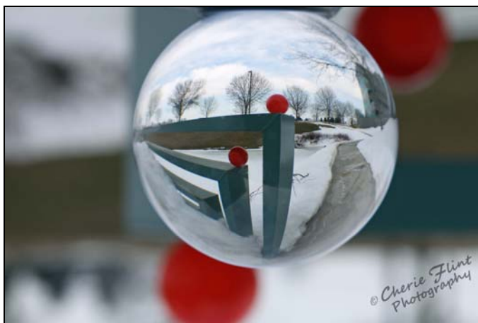
© Cherie Flint - 2 nd Place (tie)