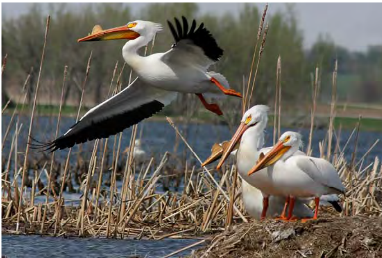
© Lynn Reihman – 1 st Place