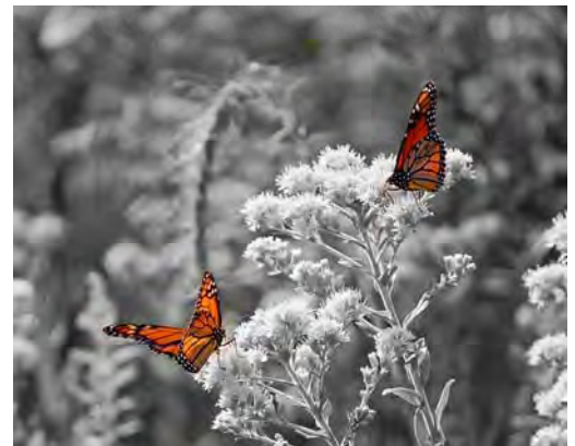
© Steve Thompson – 2 nd Place