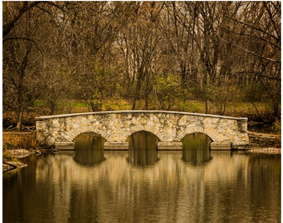
“Tranquil Trio Reflections” ©Connie Wedemeier 2nd Place: Rule of Odds