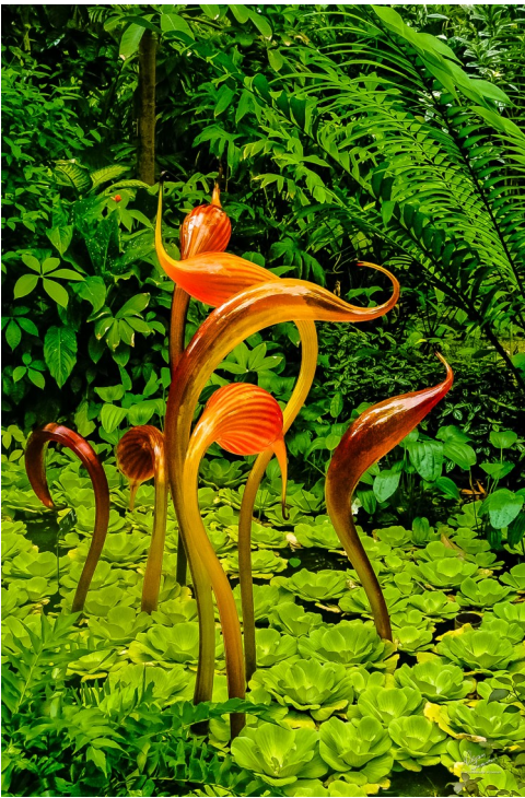
“Chihuly Herons” 3rd Place: Rule of Odds