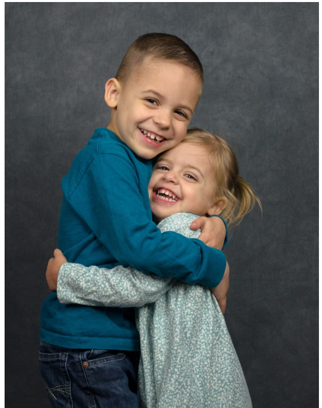
“Grandkids” 1st Place: Happiness