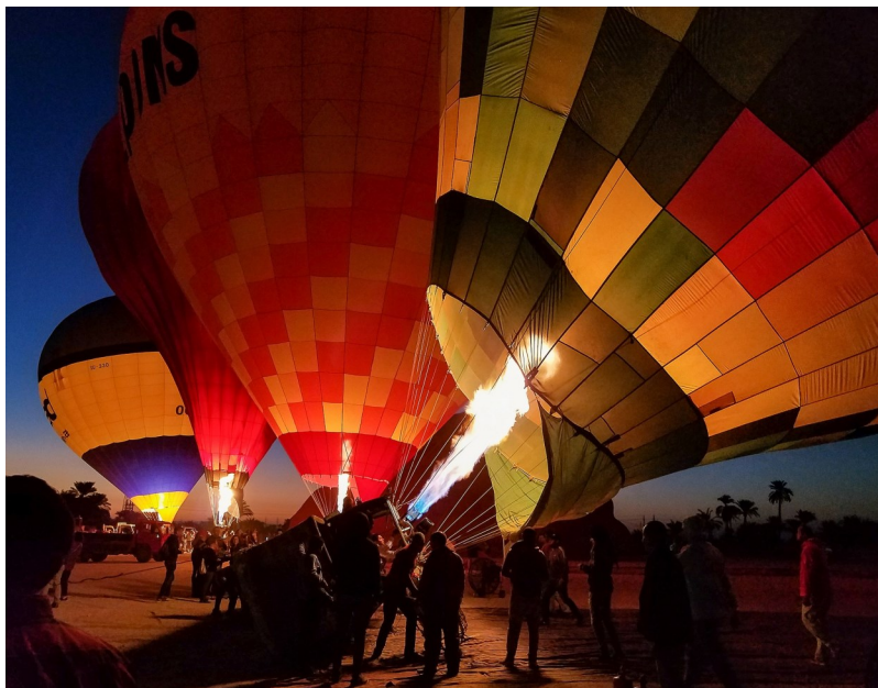
“Getting Up With the Sun” Keith Sutherland

We’re requesting digital images of the talented entries in the 2023 Annual Photo Contest. They’ll be displayed on our website. Only three in each category received top honors, but there were many deserving photos. We’re accepting ANY image that was submitted.