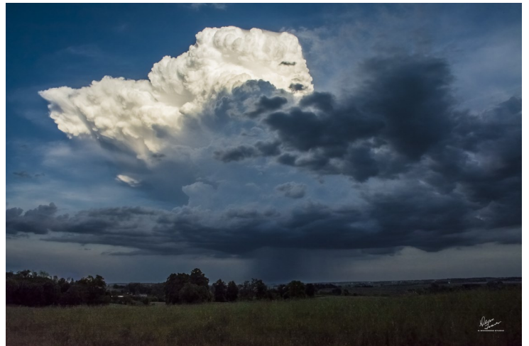
“SPRING STORM” © DEAN TRAVER