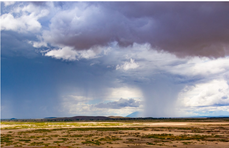
“SCATTERED SHOWERS” © MARY HOWES