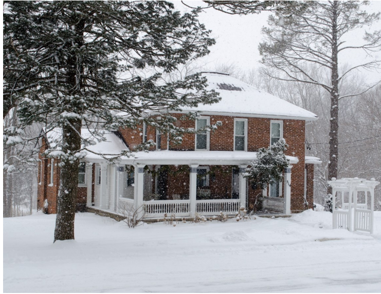
“UNTITLED” © GARY SIEGLE