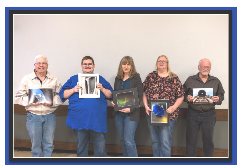
Unusual Point of View