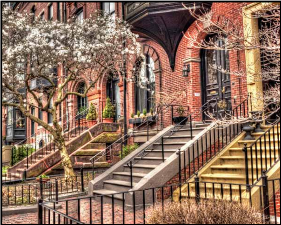
© Pam Olson, People's Choice winner , 2016 Mercy Medical Center photo contest