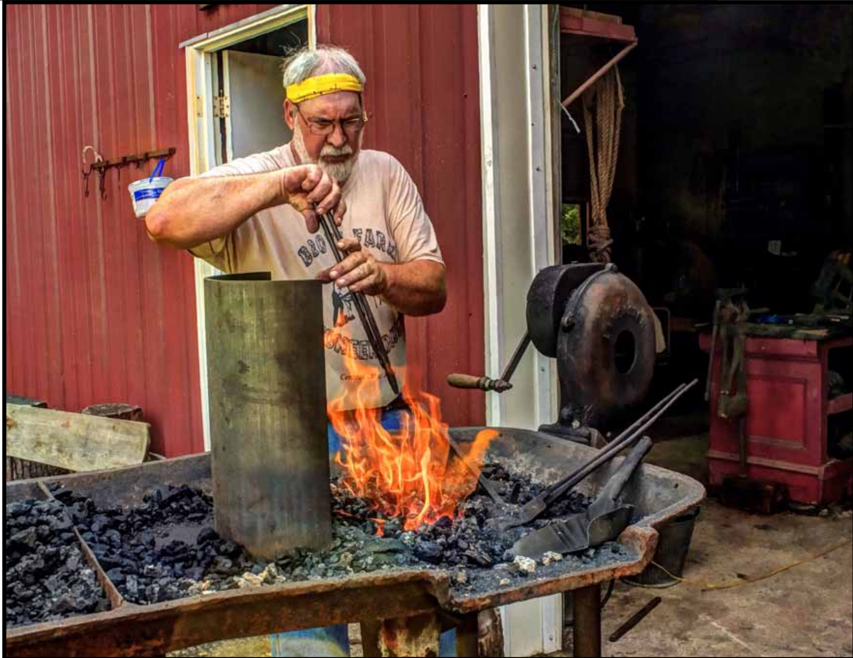
© Pam Olson, 2nd Place, September Contest

Official Newsletter of the LINN AREA PHOTO CLUB